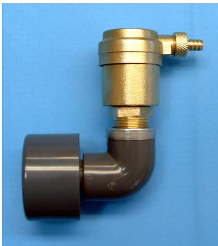
Airing valve for sunpanels.